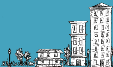
Oregon Smokefree Housing Project